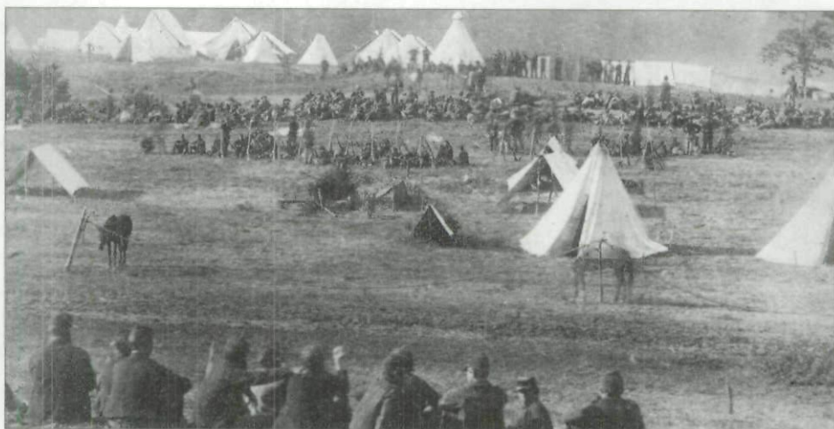
Confederate prisoners captured at the battle of Fishers Hill, Virginia

Southern civilians, who showed no inclination to throw off their radical leadership. The gloves were about to come off Union military power.