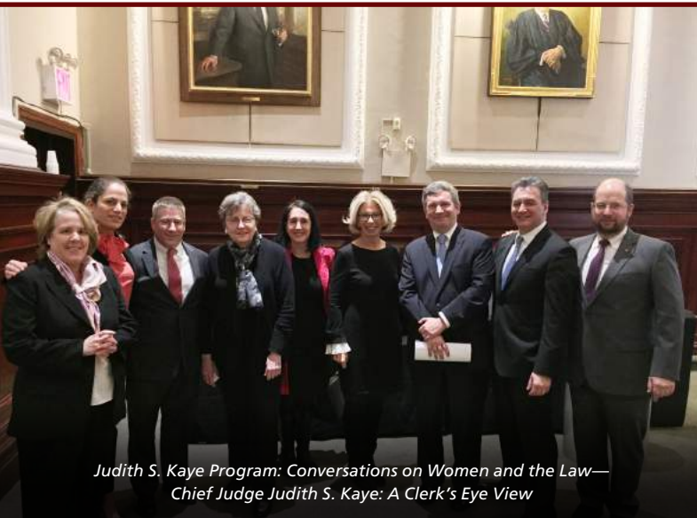
Judith S. Kaye Program: Conversations on Women and the Law— Chief Judge Judith S. Kaye: A Clerk’s Eye View