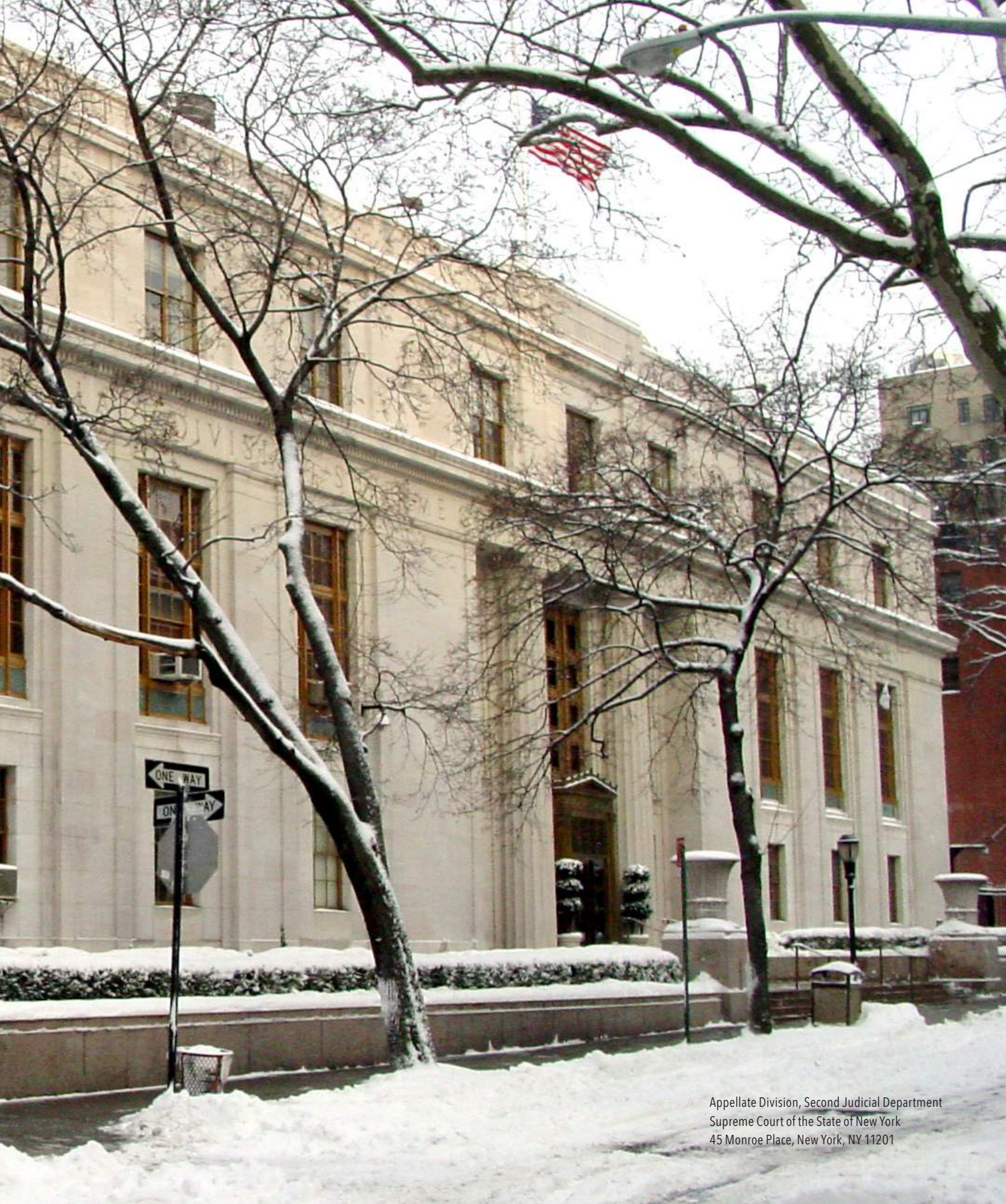
Appellate Division, Second Judicial Department Supreme Court of the State of New York 45 Monroe Place, New York, NY 11201