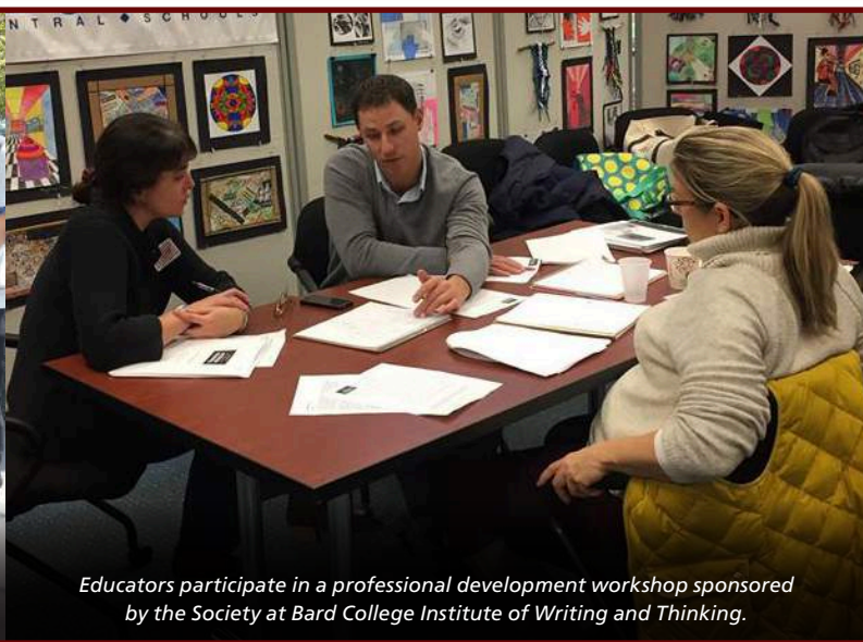
Educators participate in a professional development workshop sponsored by the Society at Bard College Institute of Writing and Thinking.