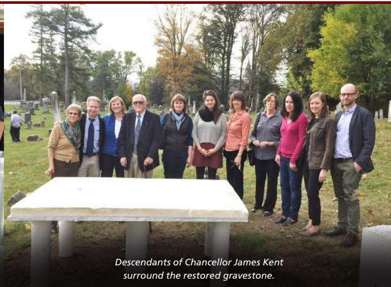
Descendants of Chancellor James Kent surround the restored gravestone.