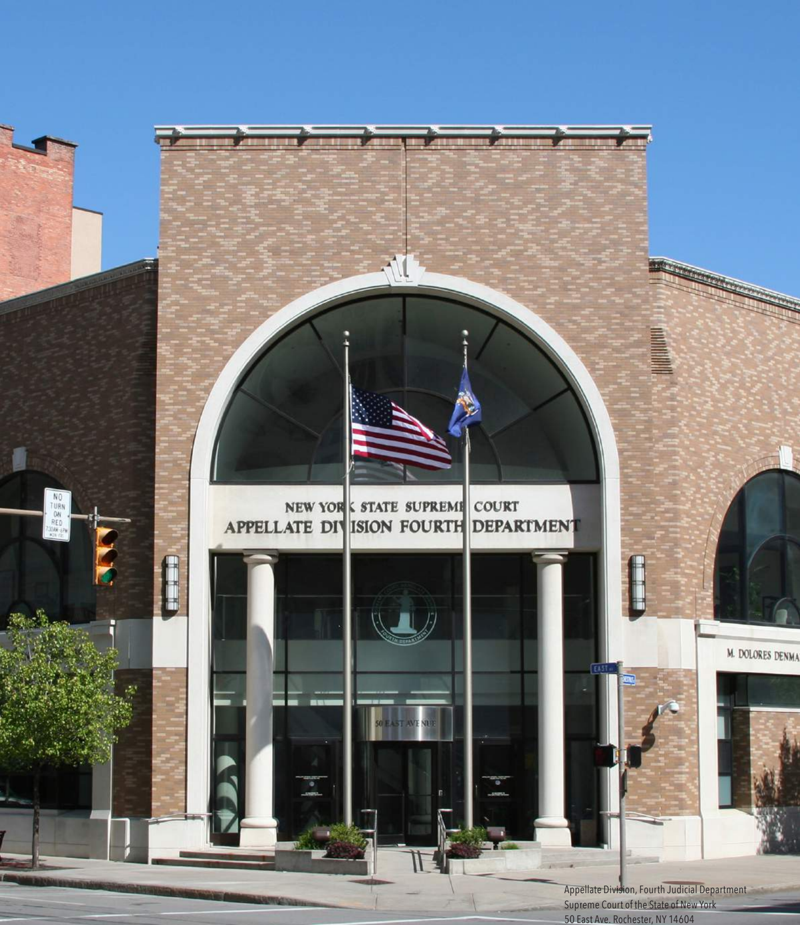
Appellate Division, Fourth Judicial Department Supreme Court of the State of New York 50 East Ave. Rochester, NY 14604