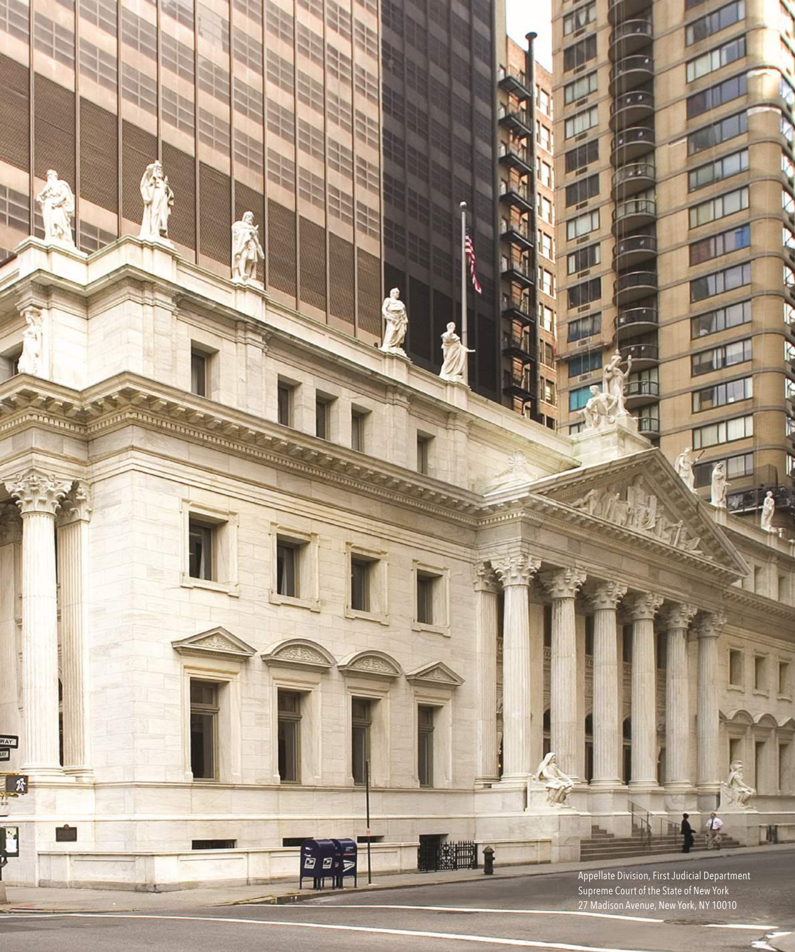
Appellate Division, First Judicial Department Supreme Court of the State of New York 27 Madison Avenue, New York, NY 10010