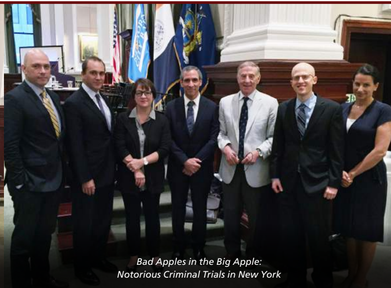
Bad Apples in the Big Apple: Notorious Criminal Trials in New York