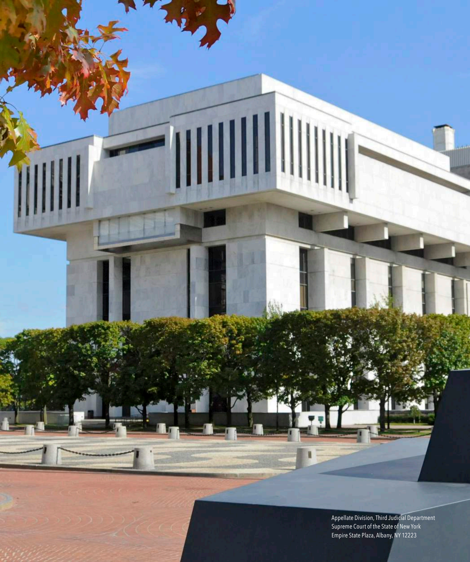
Appellate Division, Third Judicial Department Supreme Court of the State of New York Empire State Plaza, Albany, NY 12223