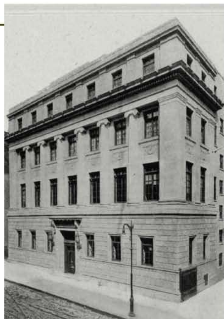
The Children's Court - This impressive ionic structure is dedicated to the task of straightening out the snarls in the lives of little folks (Edison Monthly, May 1916)

Viewed in perspective, as an institution which has evolved progressively over the course of almost two centuries, Family Court has much to be proud of. At the same time the court remains a work in progress, a perhaps permanent attribute of a tribunal devoted to the family. The next step may be merger with the Supreme Court, a move that would enhance the court's stature and lead to a truly unified family tribunal that would encompass divorce jurisdiction and juvenile justice proceedings (now divided between juvenile delinquency, juvenile offender and youthful offender jurisdiction). The court has a rich history to cherish and, hopefully, to build upon throughout the twenty-first century. ■