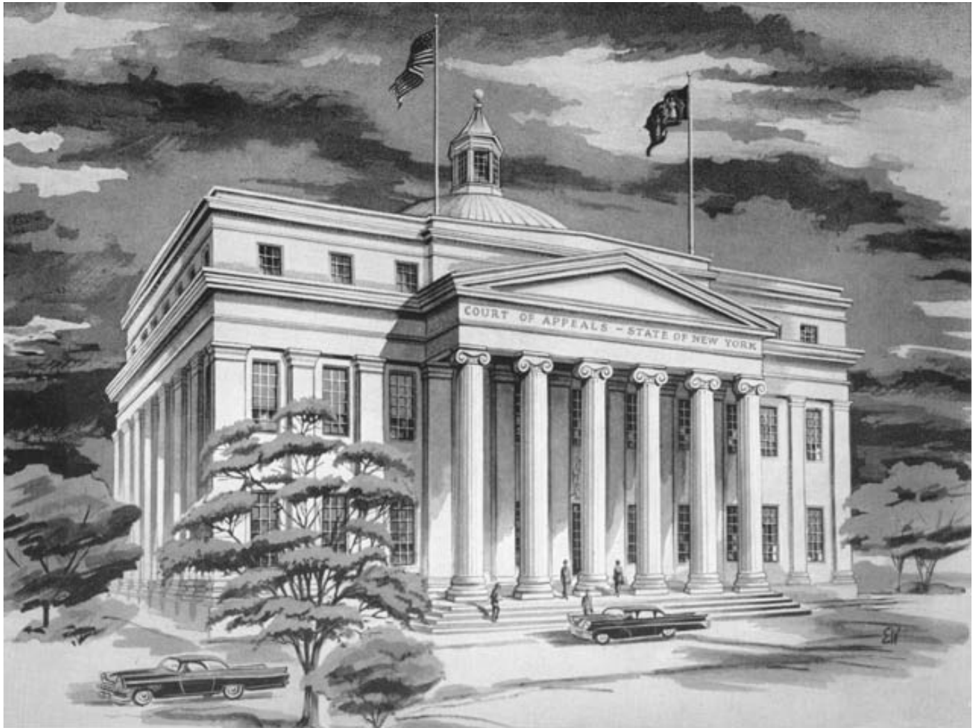
COURT OF APPEALS HALL TODAY

"The Rededication of the Court of Appeals"